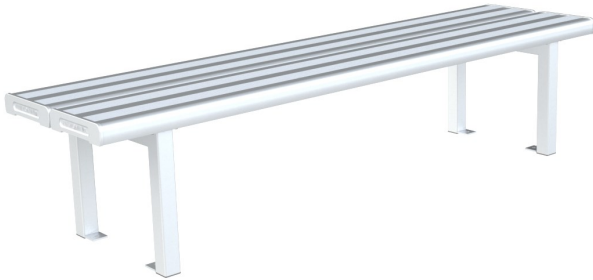
DOUBLE PLANK x2 m. SEATING. (Code No: FELGCR12)