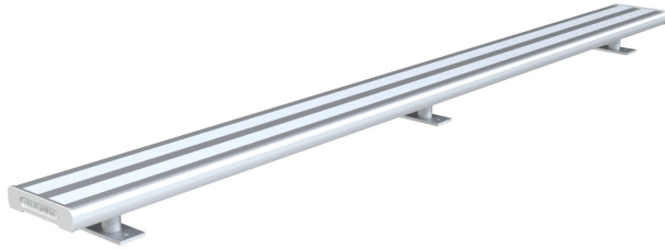
2m. EZYSEAT ABOVE GROUND BENCH SEAT (CODE No. EZYPAG2)