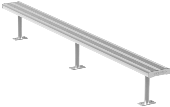
4m. - ABOVE GROUND BENCH SEAT (CODE No. FELAG4)