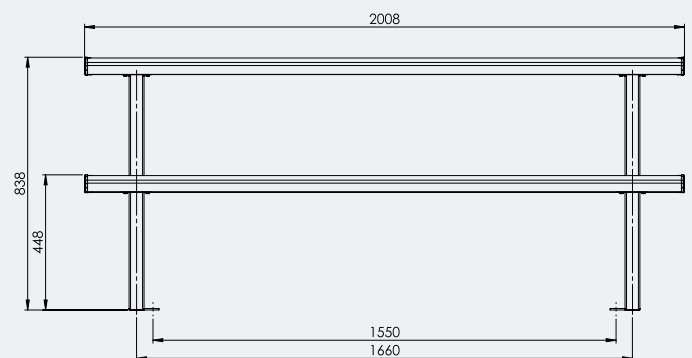
Table Top: 2008mm L x 774mm W x 838mm H

Overall Plan: 2008mm L x 1257mm W x 838mm H